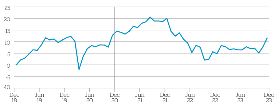
— Brooks Macdonald International Cautious Balanced Strategy Class B (Retail) (£)

Brooks Macdonald Asset Management (International) Limited was appointed Investment Manager of the fund on 1 December 2020.